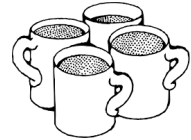
Tea (lots) (Coffee optional)